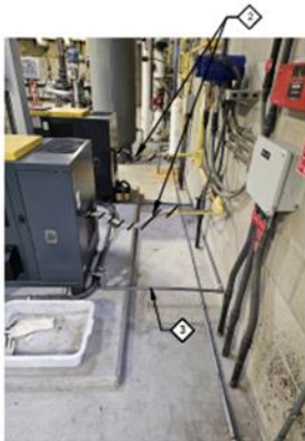
2 PHOTO SCALE: NO SCALE FILE: 202646_05D402.jpg